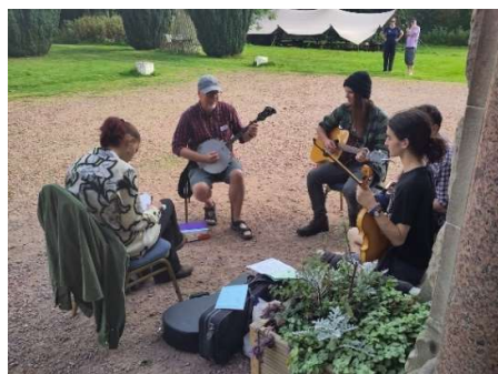
Friends practising for the ceilidh

My family and I went to the Wiston Weekend in September. It was a joyful all age gathering with a lovely ceilidh on the Saturday evening. Sunday was the first Quaker meeting where my 10-year-old stayed in worship for the full hour since she was a baby.