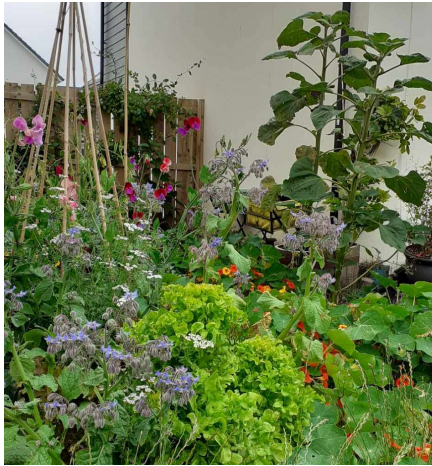
Our "Veg Patch" in August

It's Autumn! Our veg patch is now past the "so burgeoning it's mildly alarming" stage – and the garden has stopped producing upsetting numbers of courgette/marrows. We also managed to produce two tiny butternut squash and three perfect ichi kuri squash.