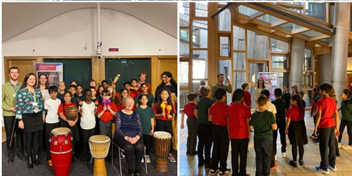
Children from Oakgrove School perform 'Wangari's trees of Peace' at the Parliament 21.09.23

Anyone reading my newsletters will know about the Peace at the Heart exhibition. It is an exhibition on the values of Peace Education that has been organised by the Parliamentary Engagement Working Group alongside Peace Education Staff working for Britain Yearly Meeting. It went to the Scottish Parliament 26-28 September.