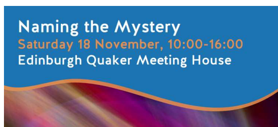
Naming the mystery banner

On the 18 th November Woodbrooke are holding an event at Edinburgh Meeting House on 'Naming the Mystery'.