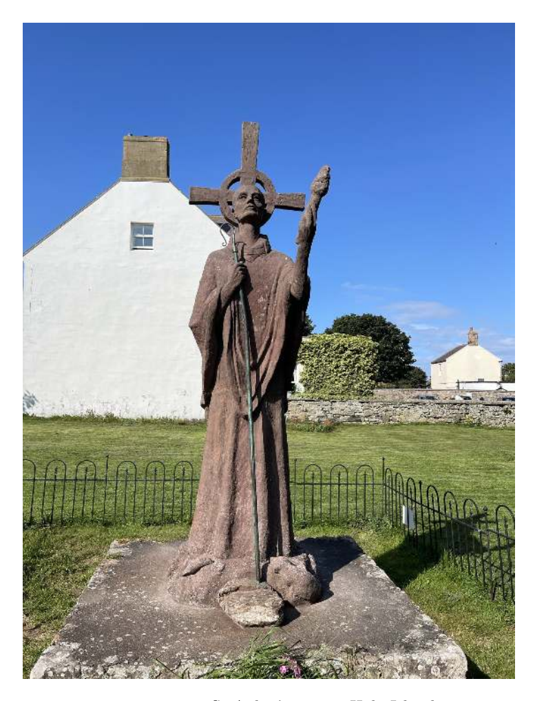
Photograph 17: St Aidan's statue, Holy Island.

The opinions expressed in this publication are those of the authors and not necessarily the opinions of the Society of Friends in Scotland, Britain or elsewhere.