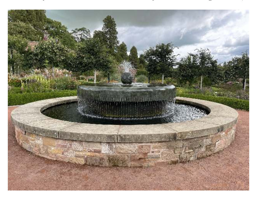
Photograph 16: Water fount ain at Dumfries House.

What have Quakers said about all this? Very little since August 2021, until