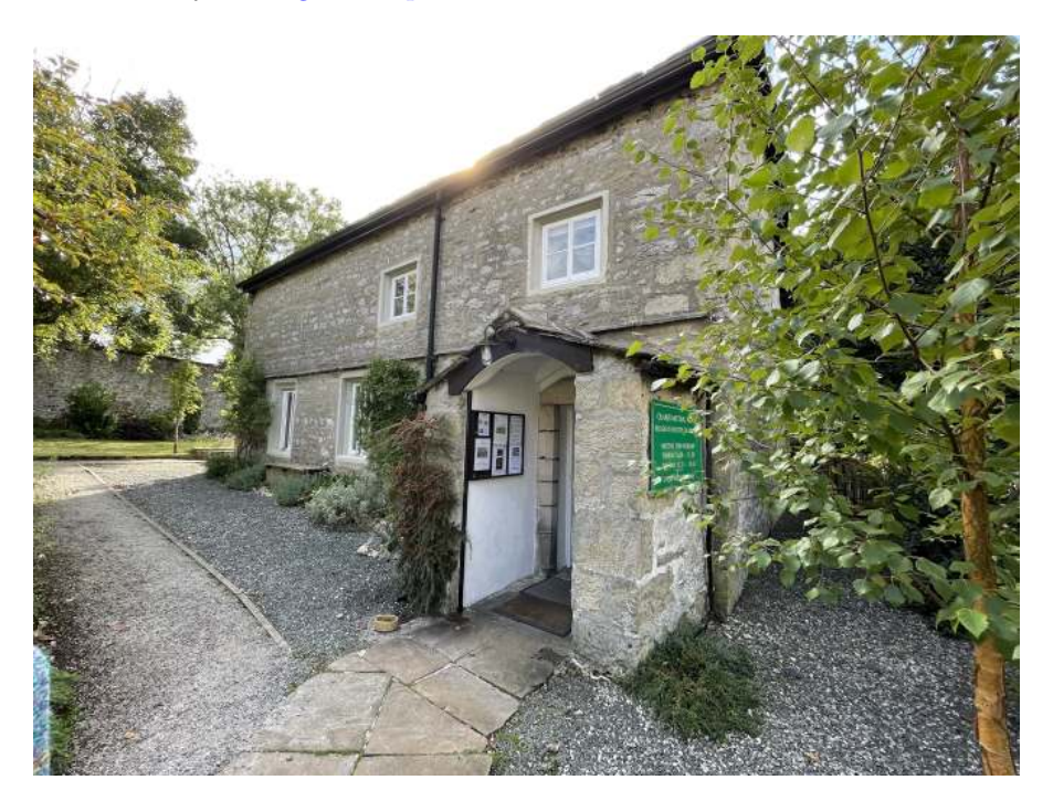
Photograph 15: Quaker Meeting House, Settle.

Do, please, bear in mind that help exists, and it's not a sign of weakness to ask for it – you don't have to suffer alone! The Quaker Mental Health Fund can be contacted via their website www.quakermhfund.uk, by phone 07395 565 428 or by email grants@quakermhfund.uk.