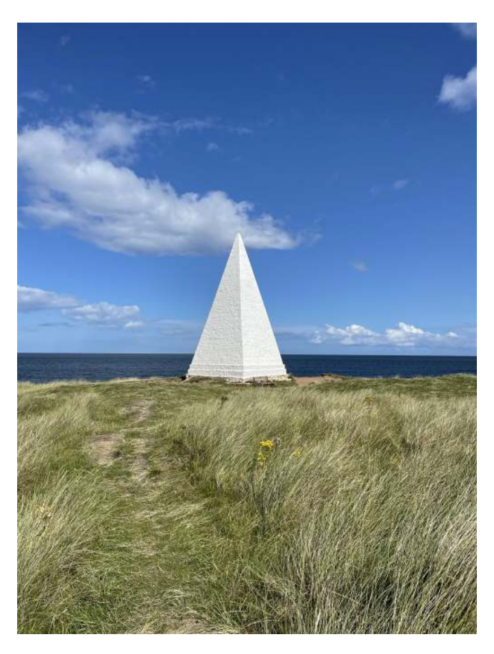
Photograph 5: A marker on Northumberland coastal path.

In our closing act of worship, Synod was declared closed until next year, when we hope to meet again. Joyfully we sang great is thy faithfulness, o God my father , and we were sent out to love and serve the Lord . Amen.