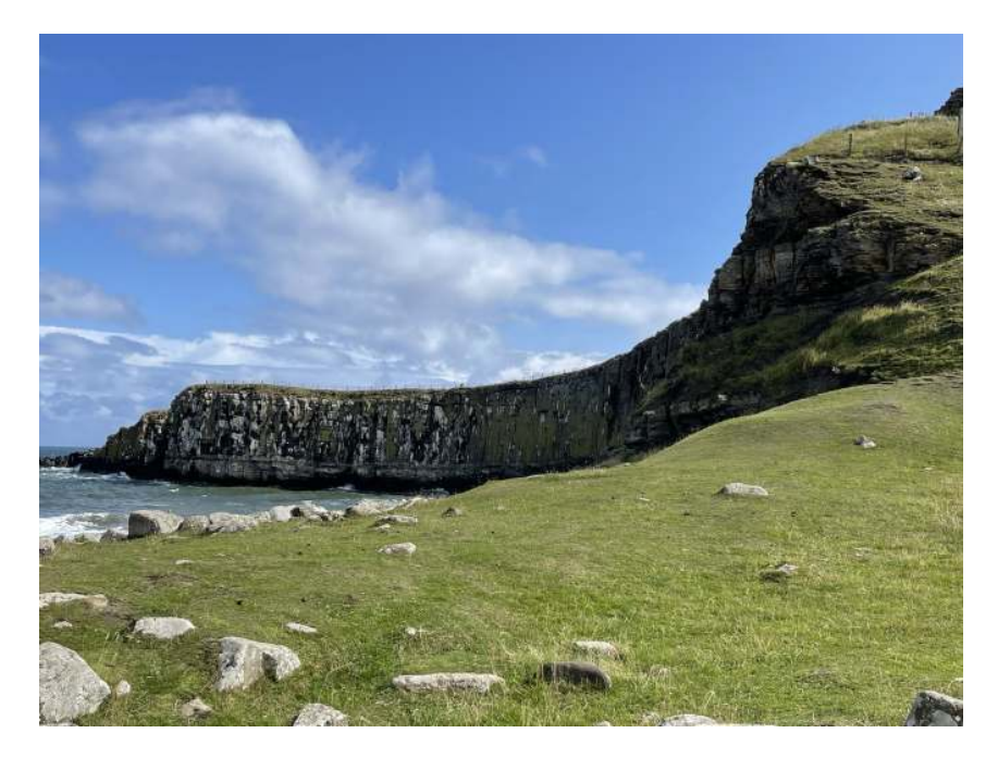
Photograph 8: A view from Dunstanburgh castle.

pared to accept that the quality of some media forms [e.g. videos] might be less than perfect – and is that imperfection distracting or inaccessible to some people? Friends House have improved recording facilities and it would be possible for volunteers to make audio recordings – but a trained voice actor would be preferable for a final recording. Would we want multiple readers for the extracts? What about audio description for video material?