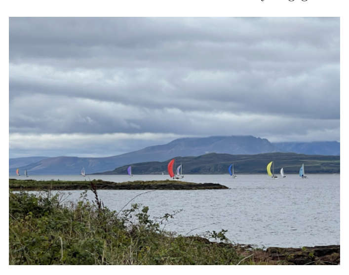
Photograph 2: A view of Arran from Great Cumbrae.

Other business will be to hear from our Parliamentary Engagement Working