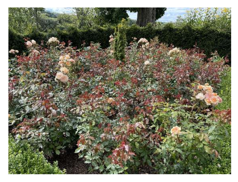
Photograph 4: Walled garden at Dumfries House.

We look forward to gathering for a blended meeting in Perth on 11 November, where we will continue our consideration of what Quakers in Scotland might look like – working together as a worshipping community as we all contribute to this "great big adventure".