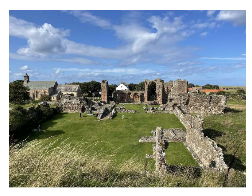
Photograph 7: Lindisfarne Priory, Holy Island.

can't complete their topic until other BYM committees have completed their work [e.g. the current review of some YM bodies and the consideration of Membership].