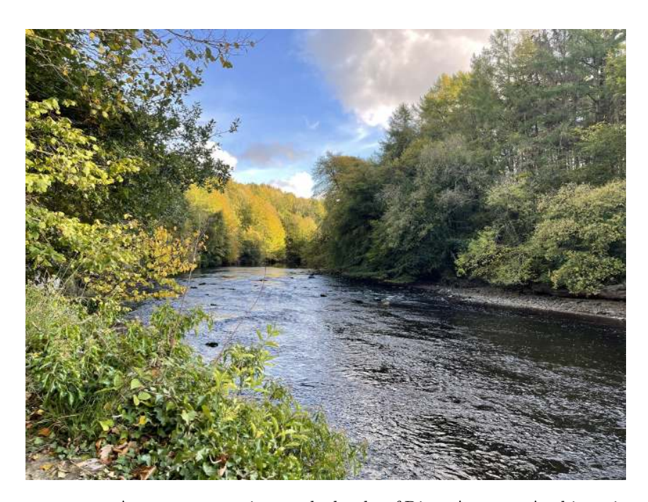
Photograph 1: An autumn evening on the banks of River Ayr near Auchincruive.