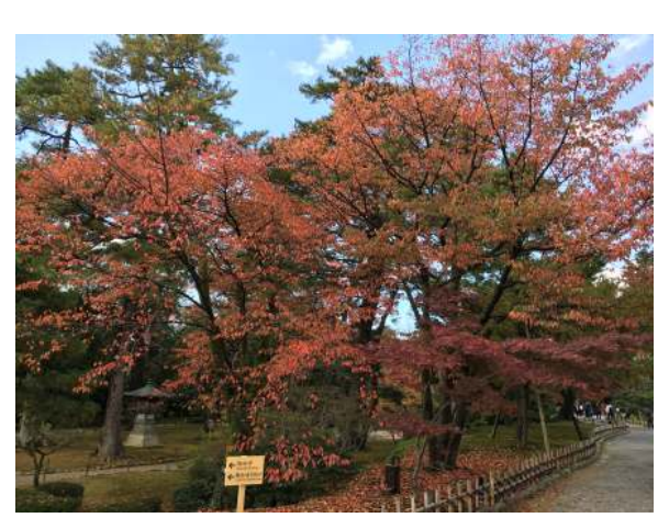
Photograph 6: Autumn colours at Kenrokuen garden, Kanazawa, Japan.

Let me seize the sun The clouds and the sky -Your heavens above. Also, let me grasp Your soothing salty sea And fresh liquid lakes. Yet even if water Runs through my fingers It is still touchable And tangible. I am tenaciously Treading a path -God knows how -To God knows where. Stopping for a few Brief moments Here and there. Perhaps somewhere, nowhere Or everywhere in between.