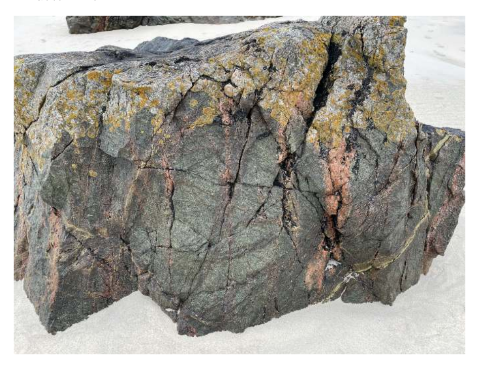
Photograph 2: A beautiful rock on the beach, Isle of Iona.