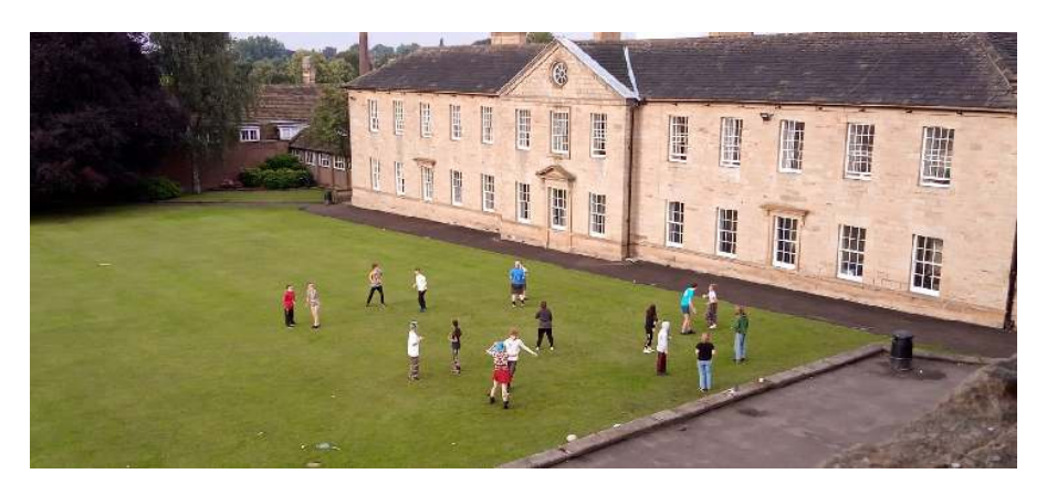
Photograph 8: A few YP's up early on a Friday morning to have to go at some outdoor Ceilidh Fusion.