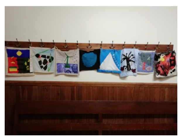
(a) A display of the panels at Aberdeen Meeting house.