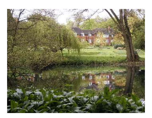
Photograph 4: Woodbrooke - Holland House from The Lake.