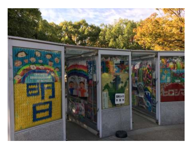
Photograph 3: Art work by school children, Peace Memorial Park, Hiroshima, Japan.