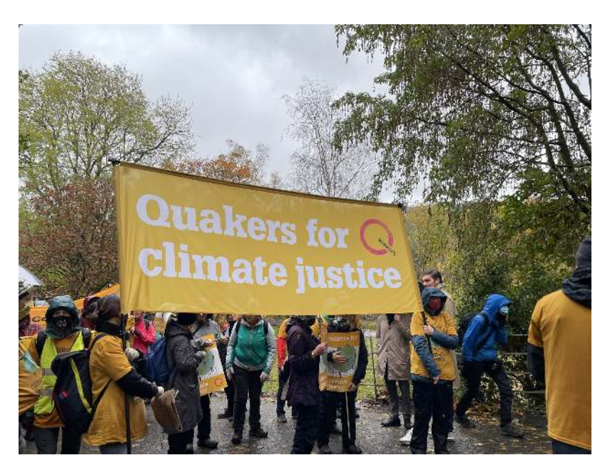
Photograph 1: Climate march leaving Kelvingrove on Global Day of Action for Climate Justice.