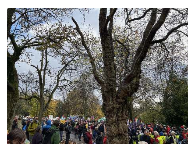
(b) Gathering for the march on Global Day of Action for Climate Justice at Kelvingrove Park, Glasgow.