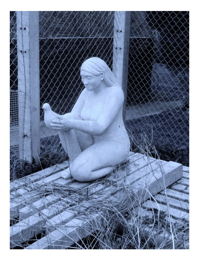
World Without Torture (Installation at Woodbrooke)

So, I felt it was a productive day, despite the extensive agenda not being fully covered. However, I did find the time spent (over 4 hours) in reading the preparation material (72 pages) considerable and some of it difficult to comprehend.