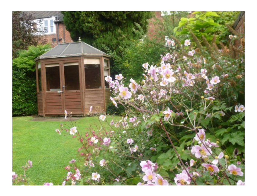
The Gazebo, Woodbrooke.