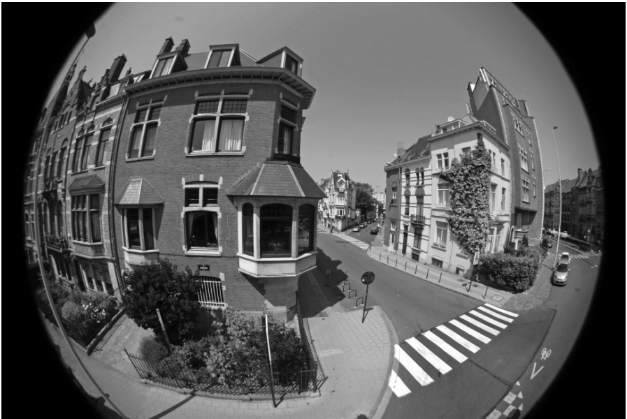
The Meeting House, Brussels.