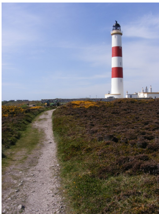
Tarbat Ness Lighthouse.

6 If the YPs do not wish to have free time outwith GM in groups they must attend the GM session in the afternoon from 2 – 4:30. Please could they have books to read or something to draw quietly, if necessary. Not a screen. LM Clerks PLEASE pass this on to young people and their parents in your Meeting. ■