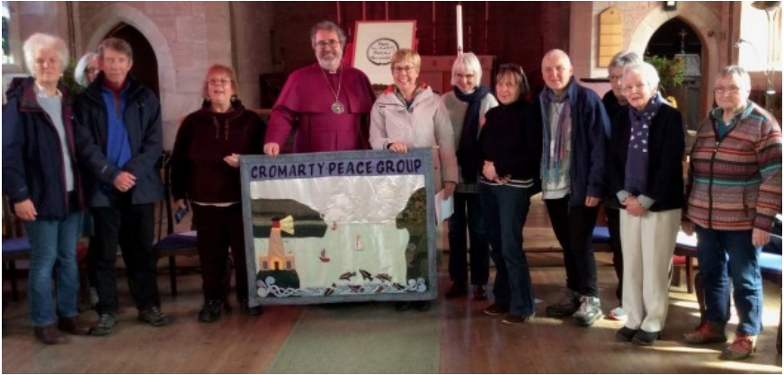
Cromarty Peace Group Vigil.