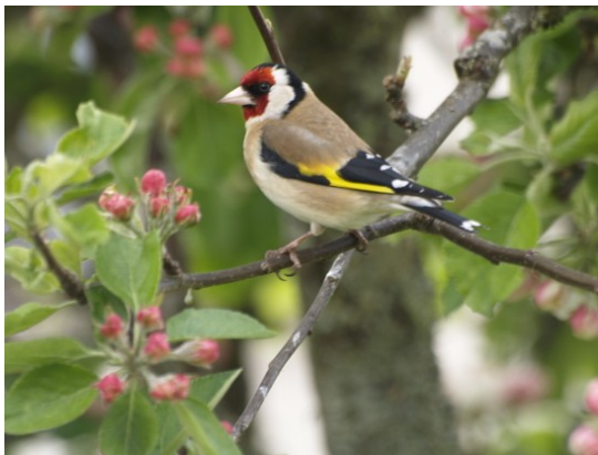
Goldfinch in Apple Blossom

As usual GM provided an occasion to eat cake before we set off home, and Perth Friends had provided for this in full though we weren't quite as greedy as usual, speaking for myself, because the Station Hotel had provided an excellent vegetarian soup, so we'd asked for a second pot as their understanding of vegetarian sandwiches was less accurate. ■