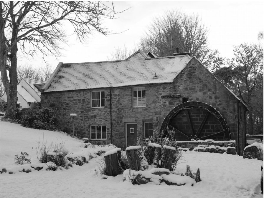
Old Mill, near Strathpeffer.