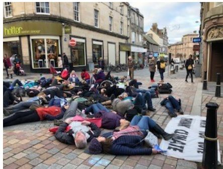
Extinction Rebellion in Inverness