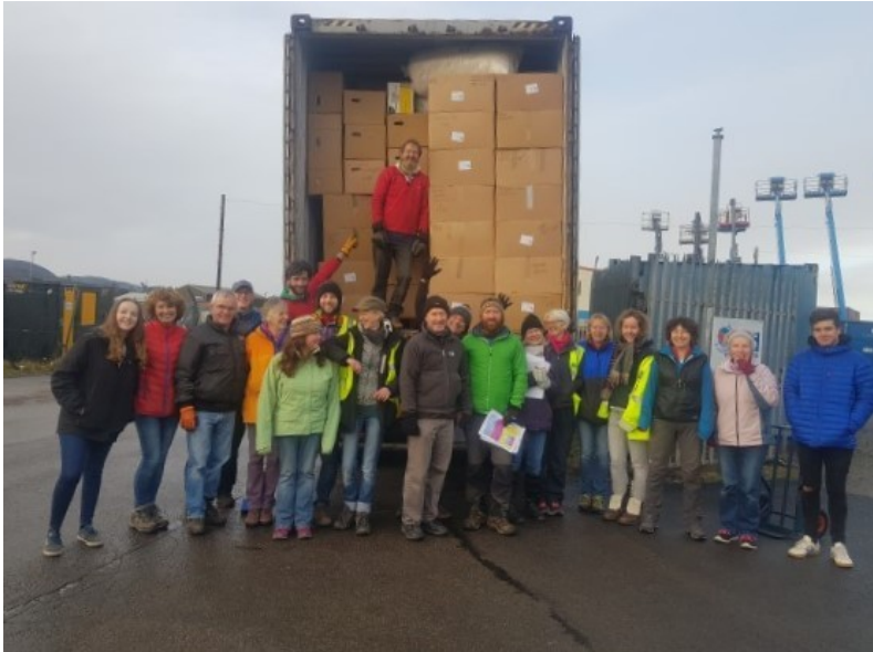
The Highlands Support Refugees loading up for Chios