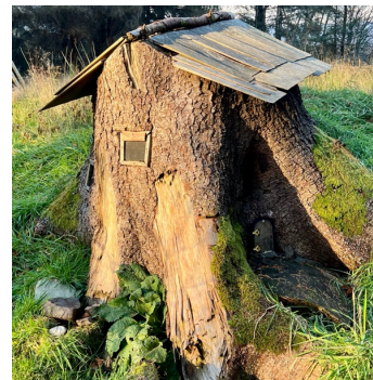
A house for elves