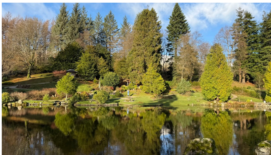
The Japanese Garden at Cowden