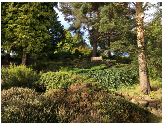
Dr Neil's Garden, Duddingston