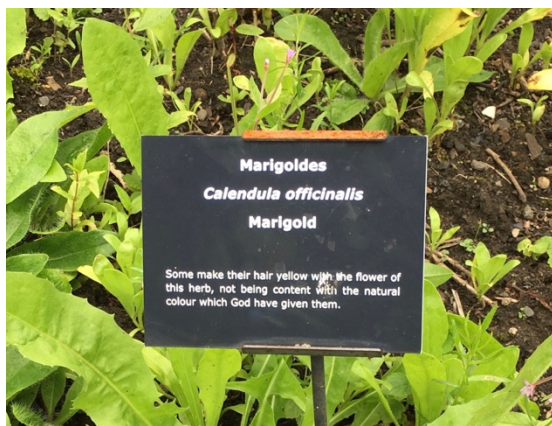
William Turner's Herbal, 1568. Morpeth *

* Some make their hair yellow with the flower of this herb, not being content with the natural colour which God have given them