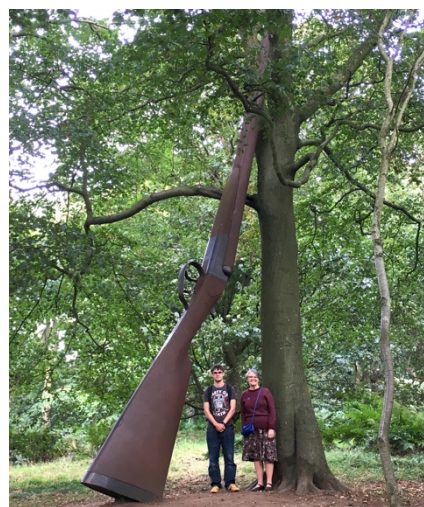
Landscape with Gun and Tree Cornelia Parker 2012 (Jupiter Artland)