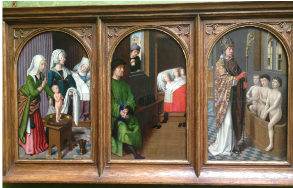
St Nicholas by Gerard David, c1510, Scottish National Gallery