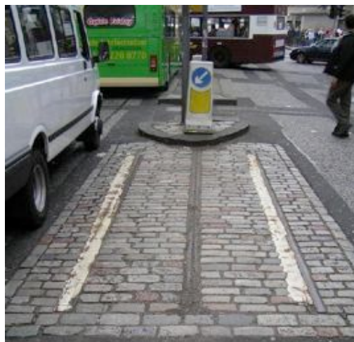
A remnant of Edinburgh's cable trams in Pimlico Place.