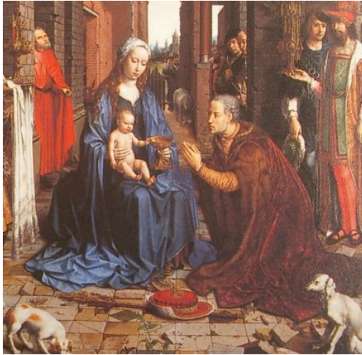
South Edinburgh Quakers