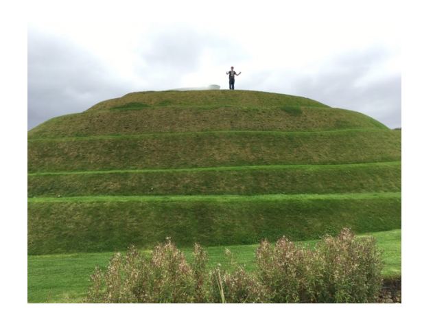
Jupiter Artland, West Lothian