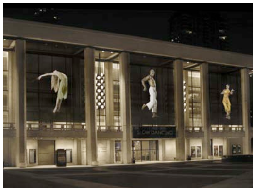
Slowdancingfilms.com. Page 4.