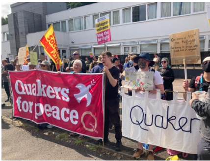
Counterprotest at a refugee hotel, Falkirk, 16 Aug

“The Palestine Action proscription is part of a wider effort to limit jury nullification.” Huw Lemmey in the London Review of Books , https://bit.ly/4m6iQ5S