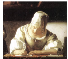
Image: Woman writing a letter, Johannes Vermeer c. 1670 (National Gallery of Ireland). Not shown, her maid by her side.

Please address any questions to the clerks, an elder, or a pastoral care Friend.