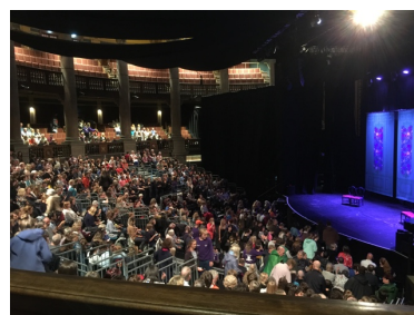
Venues: a spiegeltent and McEwan Hall