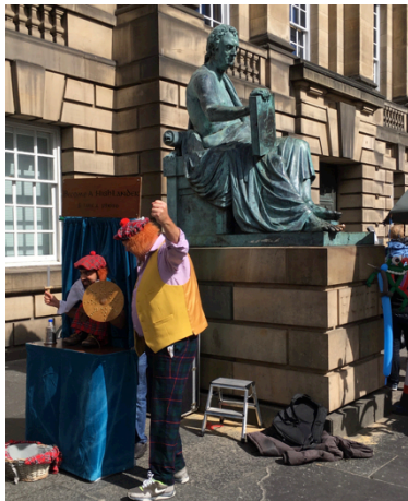
Wealth of nations