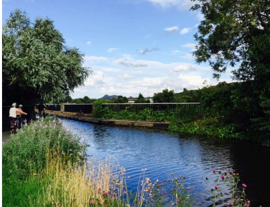
The Union Canal at Slateford Aqueduct (opened 1822)