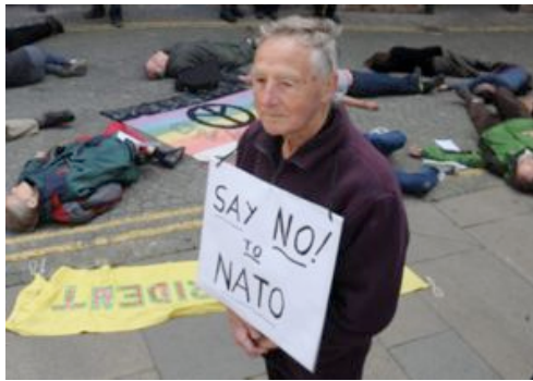
Outside SNP HQ