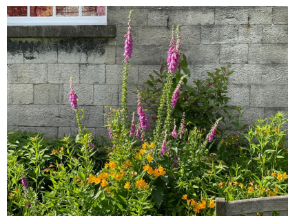
Foxgloves at Kendal Meeting House (Tapestry within).