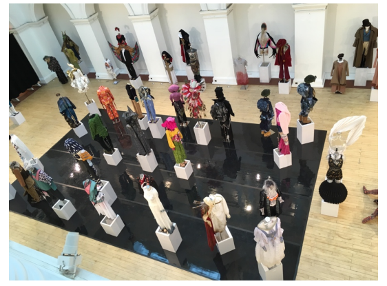
Degree show, Edinburgh College of Art