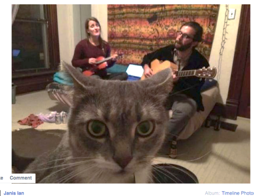
Janis Ian Album: Timeline Photos Prease share this picture to raise awareness of the plight of cats trapped in a folk music Shared with:

The Festival is approaching. Please share this picture to raise awareness of the plight of cats trapped in a folk music environment.