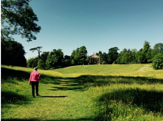
Peace in June. A temple in a garden at Stowe.