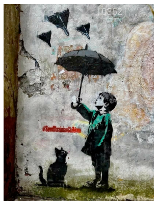
Banksy-style mural in Lviv by Andriy Yermolenko

We are few in numbers and it feels to me like the meeting of a little family; it helps to know a little about those individuals who patiently continue to pray for peace in the midst of a terrible adversity that I can only imagine.