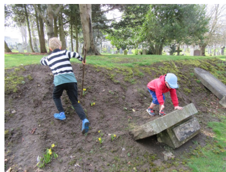
Urgent activity (p3). They'll need a biscuit (p4).