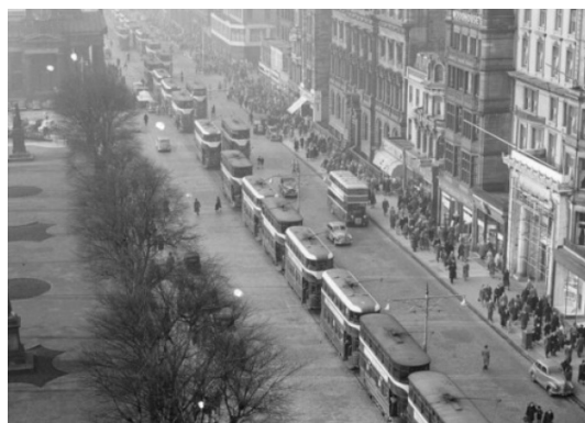
Tram photos from Lost Edinburgh (Facebook)

Read this and more at quakerscotland.org/south-edinburgh