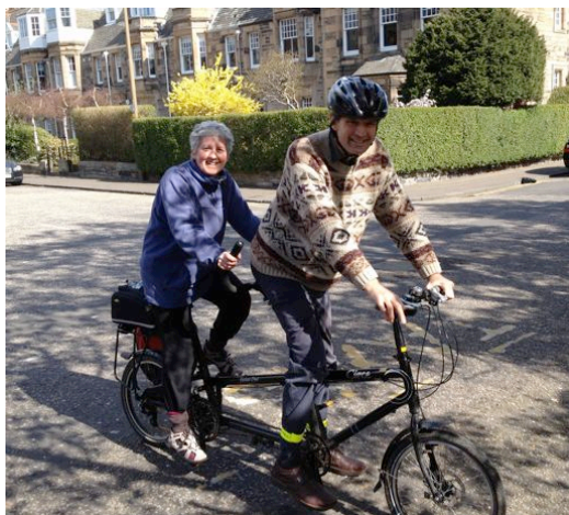
Go faster – Slow down