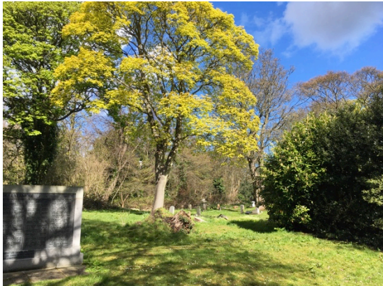
Great War stone, Newington Cemetery