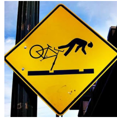
Bicycles will go down, Edinburgh