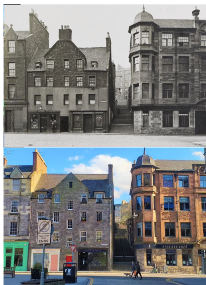
The foot of the Vennel, Grassmarket, 1914 and now.

Our Town (Edinburgh) Stories go beyond text to include historic images, video, audio, which you can spend hours exploring by map or list at www.ourtownstories.co.uk