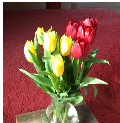
Spring is here ii