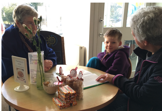
We discussed Lent