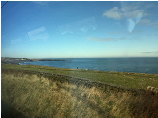
The sea at Berwick, springtime