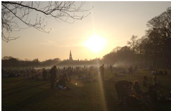
Smoke from scores of BBQs on the Meadows on a late March evening (#somethingwronghere)