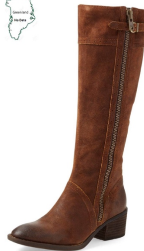
Italy (see p4)