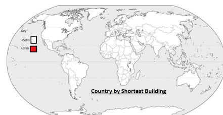
Countries by shortest building (<50m, >50m).

Countries arranged by geographical location. Note how all the African countries are clustered together, as are all the European countries. New Zealand is a real outlier, on the extreme edge.