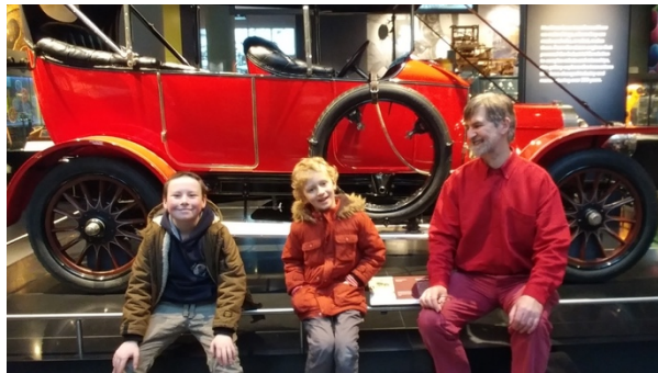
A good day at the museum, we red