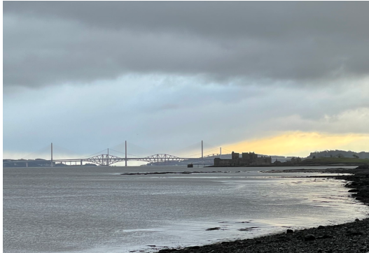
From Carriden towards Blackness Castle