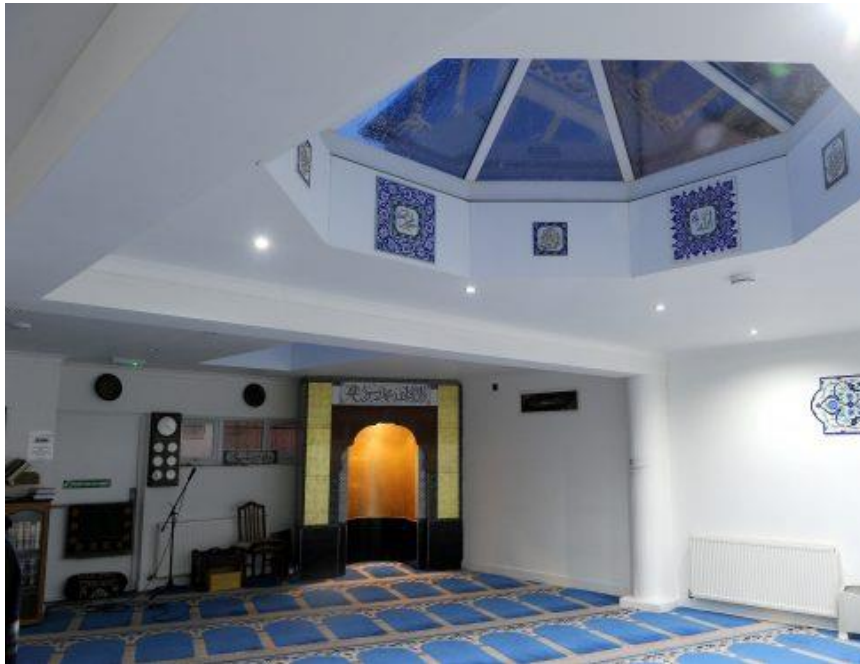
Inverness Masjid (Mosg Inbhir Nis) & The Highlands Islamic Education and Community Center