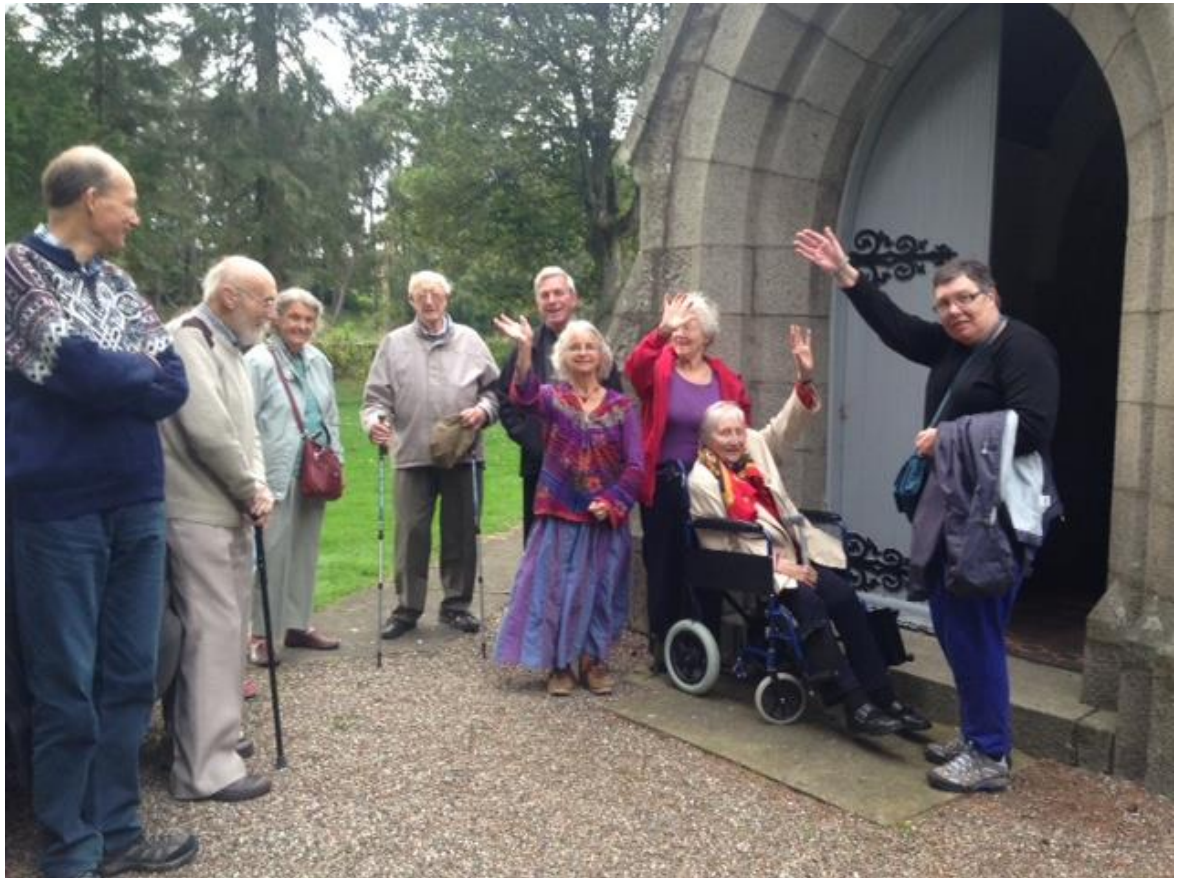
Angus Friends enjoy a trip to Glenesk