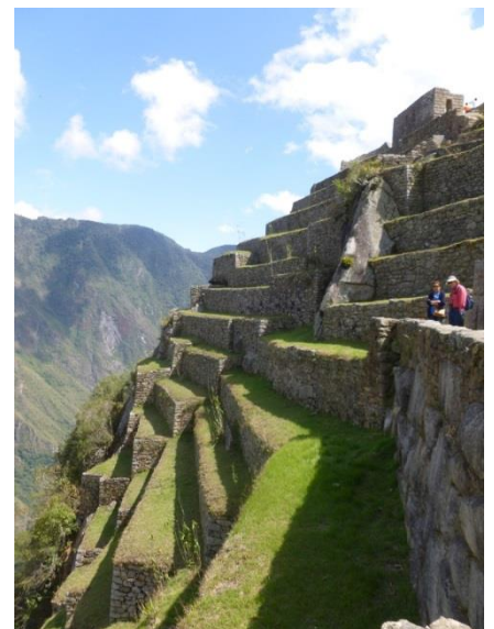
Alyson's pictures from Peru