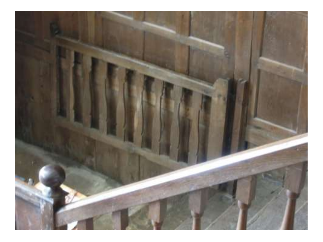
Cathra's was a pilgrimage of the sticks.