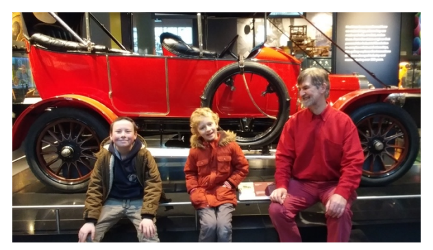
A good day at the museum, we red