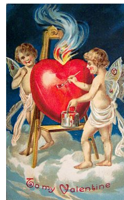
A 1909 Valentine's card

Of almost no relevance to Quakers. More below and special feature on p4.