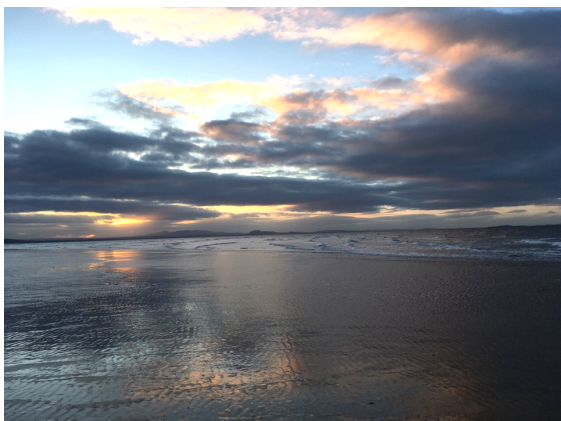
Gullane beach, Looking towards Edinburgh