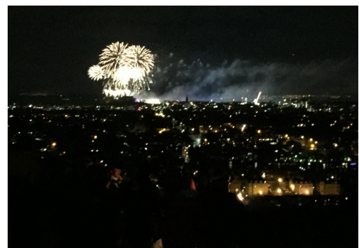
From Blackford Hill, Jan 1st.