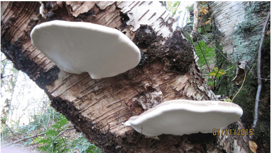
White bracket fungus