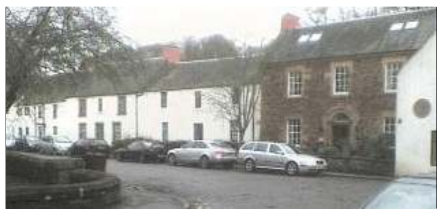
Scottish Churches House, where General Meeting was held in November