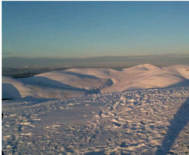
The Pentlands in January